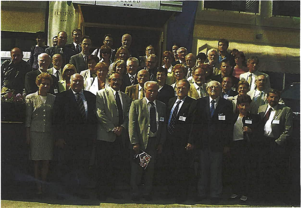
Danube Clinical Neurology Training Course Szeged, 2004