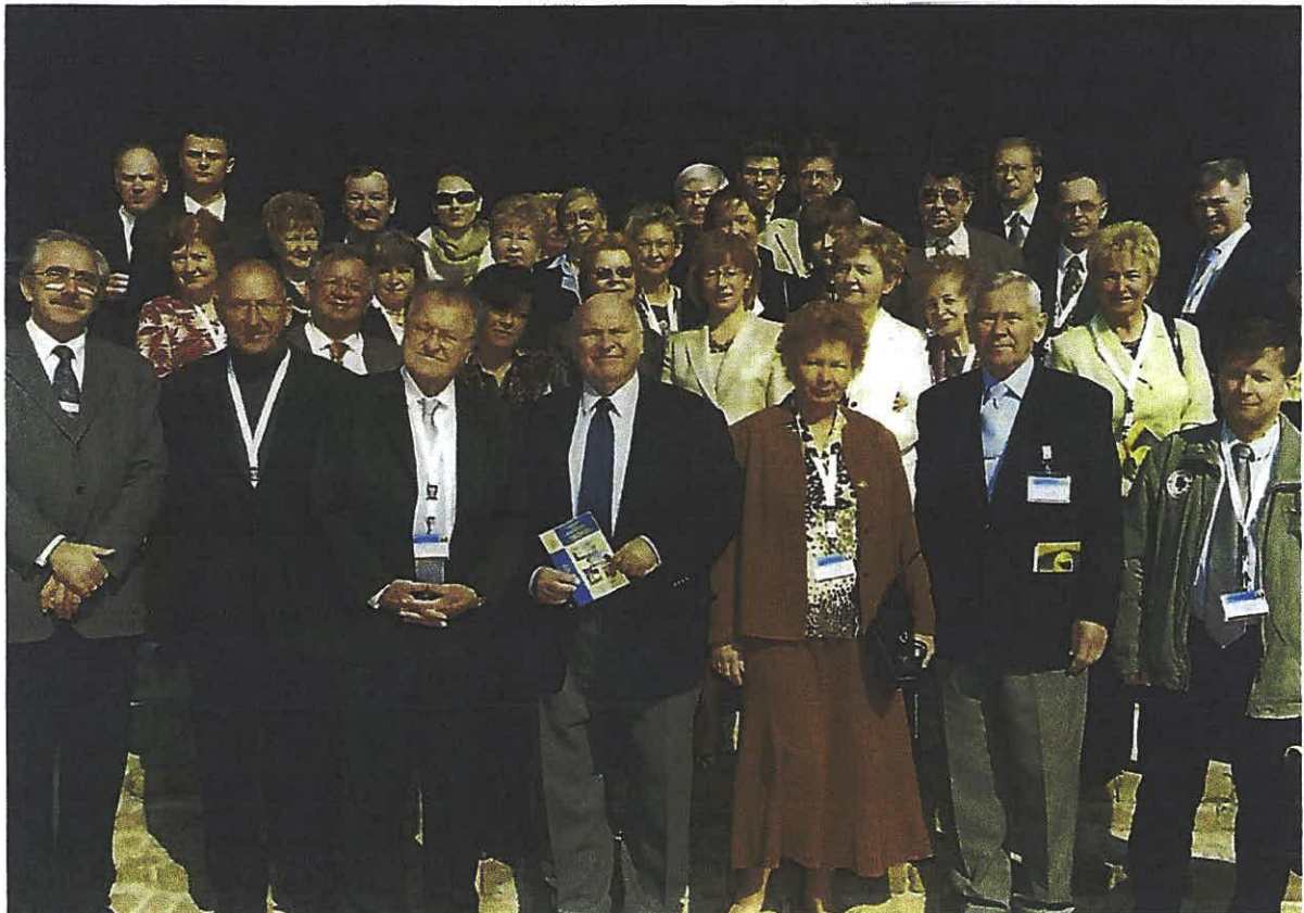
Danube Teaching Course Kazimierz Dolny, 2007